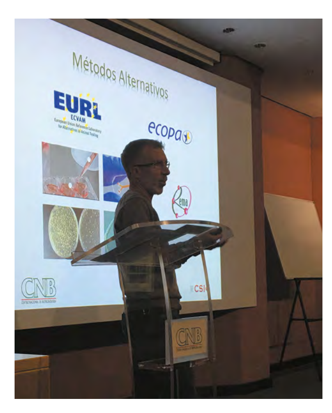
Science Week, 2022