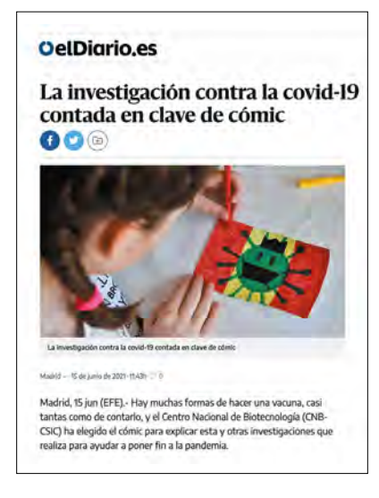
El Diario, 15-6-21