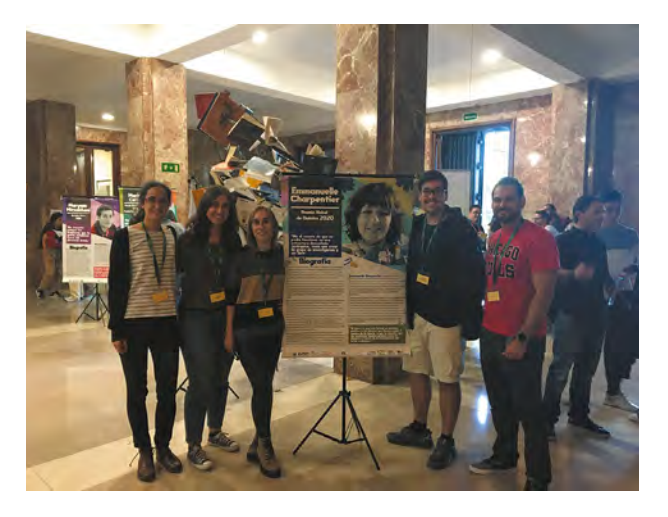
Escape Road at CSIC Headquarters, Researchers Night, 2022