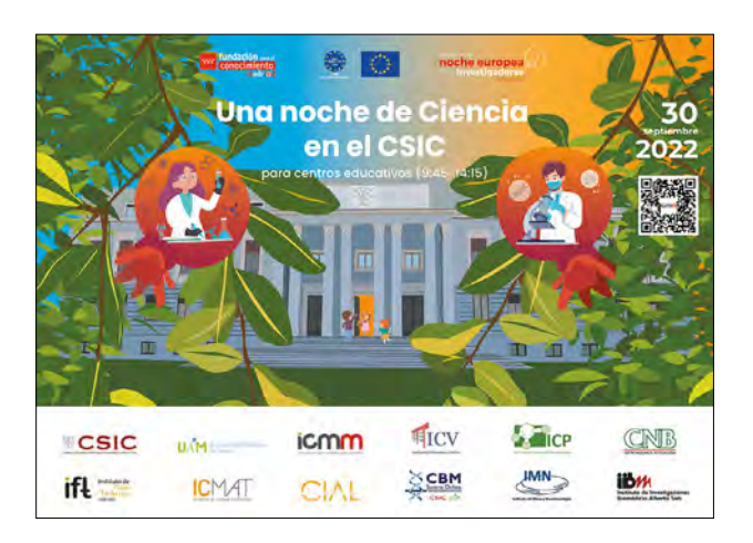
Promotional Flyer for "A Research Night at CSIC" Event

We also have a fruitful ongoing collaboration with other CSIC neighbouring research institutes located in the same campus to celebrate the European Researcher's Night. To make it easier for citizens to attend, we moved our event to different locations in Madrid city center, such as Madrid-Atocha Train Station Tropical Garden in 2021 or the CSIC headquarters in 2022. This collaboration serves also to vertebrate the "Escape Road: Looking for Female Nobel Prizes", an exhibition-gymkana to visualise and valorise the research work made by women. This exhibit has been "on tour" in commemorative dates as the International Day for Women and Girls in Science (11F) or the 8th of March, the International Women Day, but not only on those, as during the year it is borrowed by schools to use in their teaching programmes as a transversal activity.