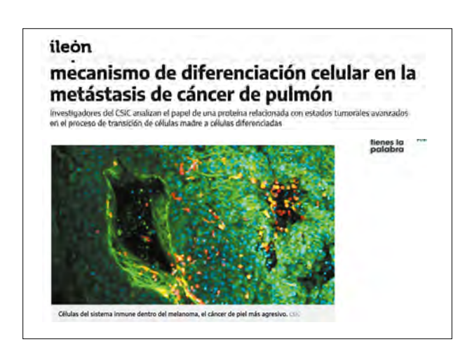
La Vanguardia. 1-8-22 iLeon. 13-10-22