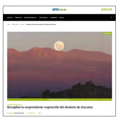
EFE Verde. 26-4-21