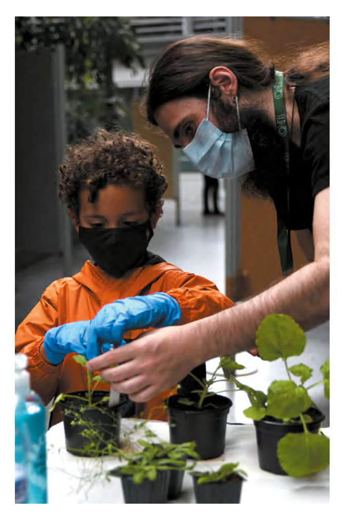
European Researchers' Night, 2021