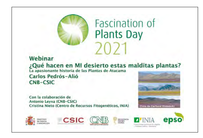
Plant Fascination Day, 2021