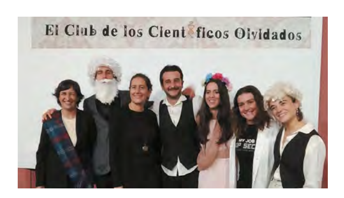
Science Week, 2022