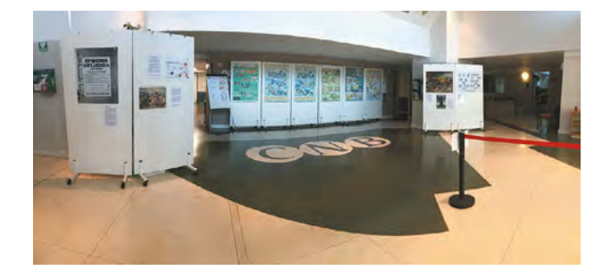
Science and Responsibility against COVID-19, CNB hall, 2021