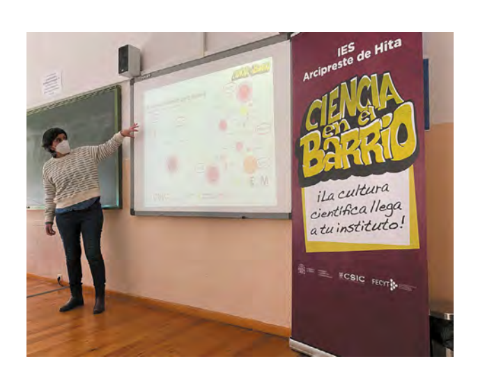
Science and Responsibility against COVID-19, IES Arcipreste de Hita, 2022