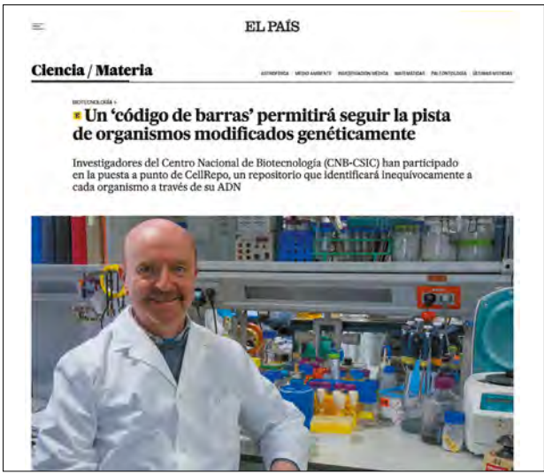
El País. 19-3-22