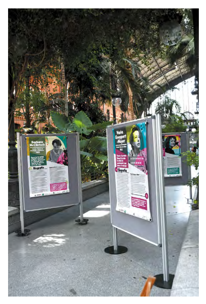
Escape Road at Atocha Train Station Tropical Garden, 2021