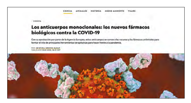
National Geographic. 3-1-22